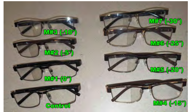
Figure 2: Model glasses. Labels are model numbers with ideal perceived location of display combiner edge. We use negative values to indicate offsets from PPOG towards the nose.

We construct eight new model glasses using the same base frame and plano lenses (see Figure 2). To control factor (4) opacity, we use the same off-the-shelf lenses for each model. To control for (5) the delta opacity between the display and the plain glass, we emulate the Vuzix Blade monocular head-worn display, which has a delta opacity of 14.20%, by laminating five layers of semi-transparent films to non-prescription glasses (see Figure 2). The resulting delta opacity was 13.38%.