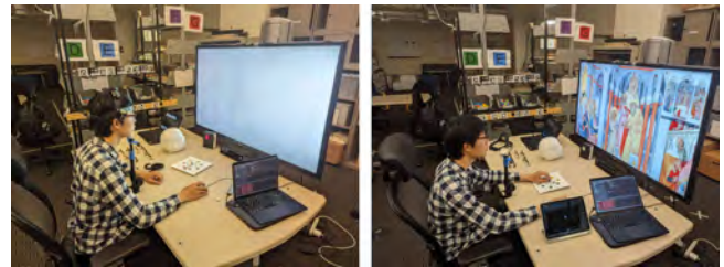
Figure 3: Calibration (left) and experimental condition (right)

To let the participants maintain a perpendicular head position relative to the VDT during the calibration process, we implemented a technique inspired by Haynes and Starner [17, 18]. As shown in Figure 3, the participant placed their head on a chin rest and wore a headband equipped with a laser pointer that was directed toward a 1-inch circle positioned approximately 0.75 meters away, which allows up to \pm 0.42^\circ of head rotation. By utilizing a microcontroller and a photoresistor, we were able to deactivate the cursor when the laser pointer was not aligned with the circle. The chin rest is positioned with an offset of 31.5mm from the center according to the 63mm averaged adult IPD [12], which makes the participant's center of right eye facing the center of the VDT. Additionally, we had calibrated the laser using a Microsoft Xbox's "Kinect for Windows v2" to initially verify that the participant's head is perfectly straight, with no tilt ( 0^\circ roll) or rotation ( 0^\circ yaw).