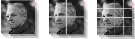
Figure 1: Illustration of the pyramid structure and color channel segments which are used to compute the hierarchical color histograms.

In order to efficiently store and process large collections of candidate near-duplicate images we need a representation for each image which is extremely compressed and efficient to compute. It is crucial that the representation be resistant to changes in scale, saturation, hue, contrast, compression, and cropping. A hierarchical color histogram is used to follow the pattern of an image pyramid with three levels.