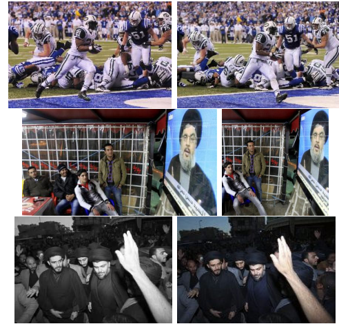
Figure 2: Examples of near-duplicate images detected in real news sources. First Row: Similar time instances. Second Row: Different image croppings. Third Row: Similar grayscale and color images.

The PhotoStand user interface consists of a map where photo thumbnails are displayed at the locations that are deemed most appropriate to the clusters that contain the news articles with which the photos are associated (e.g., Figure 4a). Initially, the map contains photo thumbnails at locations corresponding to those deemed most relevant in the k most representative clusters, where “representative” takes into account the importance of the cluster’s subject as measured by factors such as currency, size and rate of growth of the cluster in terms of velocity and acceleration rates, as well as a desire to have a good spatial distribution in the area being displayed (i.e., the viewing window). A slider is centered above the map whose movement to