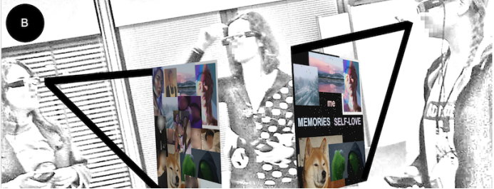
Figure 1: We studied how digital profiles are used in face-to-face interactions when a friend and strangers are collocated. Participants had access to the profile based on the social relation through head-mounted displays. A) A snapshot from an overview camera recording of one of the gatherings where strangers and friends are collocated, and B) An illustration of accessing the Digital Profiles, where the private profile of the participant who is standing in the middle was accessible by her friend (a profile on the left) and the public profile was accessible by a stranger (a profile on the right).