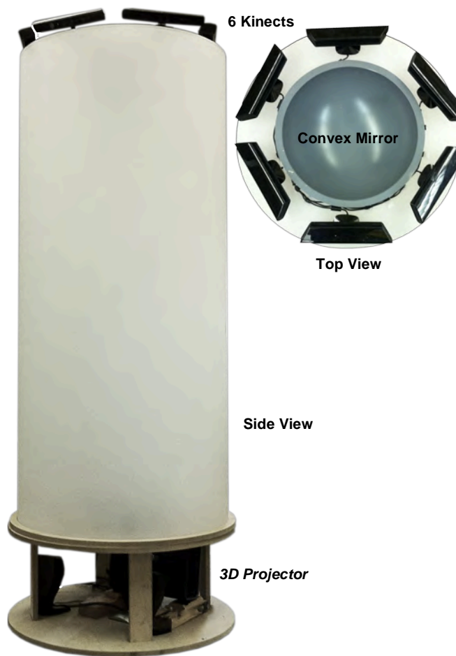
Figure 2. TeleHuman hardware: a cylindrical display surface with 6 Kinects and a 3D projector inside its base.

This allows projections of images across the entire surface of the cylinder. The DepthQ projector has a resolution of 1280 \times 720 pixels. However, since only a circular portion of this image can be displayed on the surface of the cylinder, the effective resolution is described by a 720 pixel diameter circle, or 407,150 pixels.