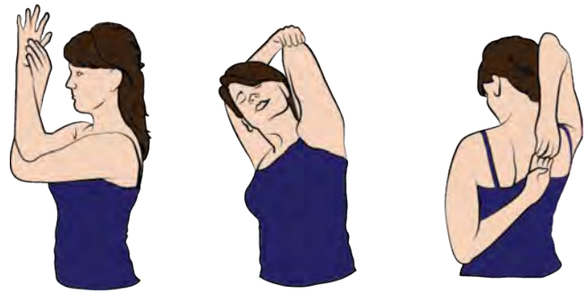
Figure 5. Sample Yoga stances used in Experiment 2.

A remote instructor, displayed on the TeleHuman, first positioned herself in one of the predetermined yoga poses (see Figure 5), one per condition. The remote instructor was blind to the conditions. At that point, the main participant (“coach”) instructed a co-located partner (“poser”) to reproduce the pose as accurately as possible, within a 3 minute time limit. The reason for using a poser, rather than having the coach assume the pose him or herself