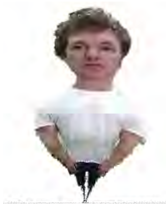
Figure 3. Textured 3D model with hemispherical distortion. When reflected off the convex mirror onto the cylinder, this produces a 3D model with proper proportions.

are modified to account for the distortions introduced by the hemispherical mirror and the cylindrical display surface. The distortion model is textured using the previously rendered camera view (Figure 3). When reflected off the hemispherical convex mirror, this creates an undistorted projection of the remote participant on the surface of the cylinder. When the user moves around the display, the distortion model ensures that the remote participant remains at the center of the user’s field of view. As this projection changes based on user position, it creates a cylindrical Fish Tank VR view that preserves motion parallax [37]. Note that our approach does have the side effects of causing both resolution and brightness to drop off at lower elevations of the cylinder.