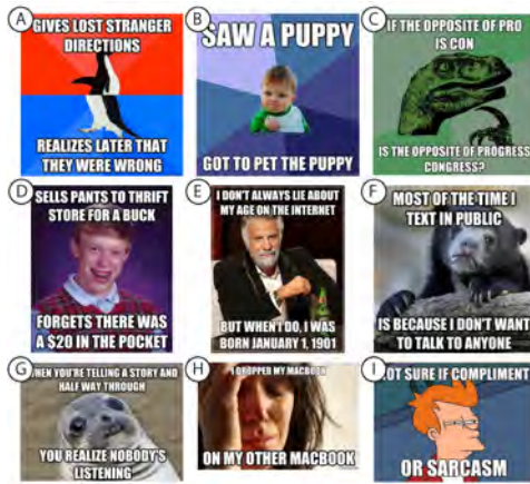
Figure 6. An example of each meme template. In the study, we used 5 example memes for each meme template for 45 total memes.