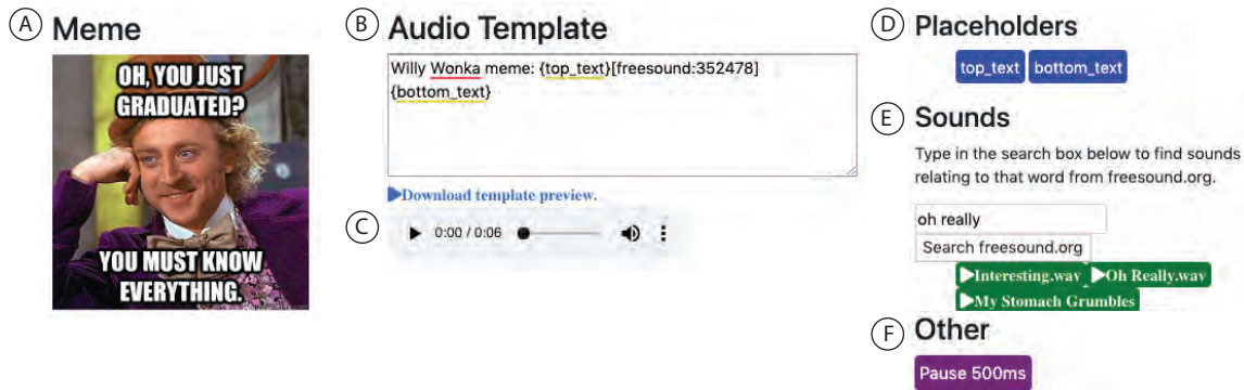
Figure 5. The meme template creation interface displays (A) a reference meme example, (B) the constructed meme template so far, (C) preview and output in text and audio formats, and then a series of tools to construct the meme template. To create an alt text template, a user can drag the (D) top/bottom text placeholders to the meme template box then write alt text in relation to where it should occur with the placeholders. The system then exports the template as text to be applied by the automatic method. To create an audio macro meme, a user can input placeholders then click and drag (E) sounds from a library accessed via search to place sounds in relation to the placeholders. Finally, users can optionally place (F) pauses for comedic timing.

The authoring interface itself is not currently accessible to screen readers, as it is designed to translate visual content, and also relies heavily on drag-and-drop interactions. In future work, we intend to explore accessible interfaces for designing audio-first or alt text-first memes, in addition to translating image macro memes.