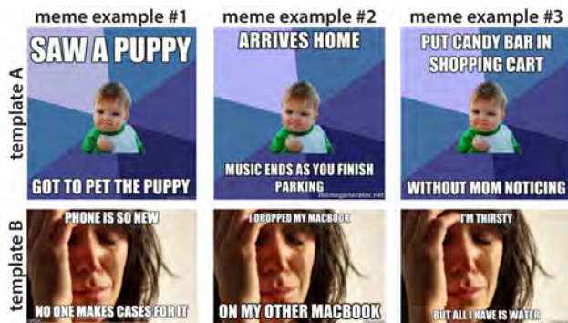
Figure 2. Examples of image macro memes from two image templates. Template A represents the “Success Kid” meme and Template B represents the “First World Problems” meme.

tifiable image macro meme can serve as shorthand for “a phenomenon, theme or meaning”. For example, the celebrating toddler image represents “common situations with minor victories” (Figure 2A), and the crying woman image represents “first world problems” (Figure 2B). However, existing alt text for image macro memes typically describe only the meme text (e.g., “Put candy bar in shopping cart without mom noticing”), dropping the relevant context provided by the template. Without the context recognized through the images, the memes often lose their emotional tone or humorous aspect.