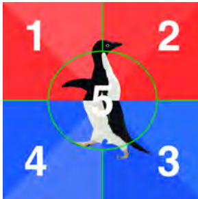
Figure 4. An example of separate regions computed for the color histogram difference measurement.

representation. We create a dataset of the 137 meme templates from Imgur 2 . To automatically match the input meme image with a database meme template, we first re-size and crop the input meme image to be the same size as the templates in the database. Then, we compute for the input meme and each database meme template: 1) the structural similarity between the input image and the template image, and 2) the color histogram difference between the input image and the template image. To compute structural similarity, we use the Multi-Scale Structural Similarity (MS-SSIM) index [33] that considers the luminance, contrast, and structural similarity between image regions at various zoom levels. To compute the color histogram difference, we divide each image into 5 regions (Figure 4) and sum together chi-squared distance between HSV color histograms computed for each region (8 bins for the hue channel, 12 bins for the saturation channel and 3 bins for the value channel) [25]. We define the final image similarity score between two images X and Y as: \alpha MSSIM(X, Y) - \beta COLORDIFF(X, Y) , where \alpha and \beta are adjustable parameters that sum to 1. We use \alpha = 0.15 and \beta = 0.85 , determined empirically. We calculate an Image Similarity score for each template with the fixed input meme example, and return the template with the highest similarity score. If the score is below a confidence threshold, we only output the meme text, as it is likely not in the database.