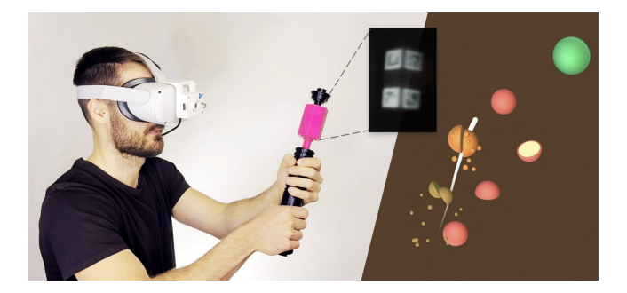
Figure 2: Using a lightsaber as a prop to slice fruits in a game.

Real-life objects as VR haptic props: BrightMarker allows users to make use of the physical shape of existing real-world objects (e.g., toys, gadgets, sports gear) as haptic proxies in VR. For example, a "lightsaber" toy could come with integrated BrightMarkers , so it can be used as a different object in games. As shown in Figure 2, the lightsaber's hilt is used as a haptic placeholder for a sword to slice fruits in a game. Another benefit is that the objects are fully passive, while typical VR game controllers contain infrared LEDs that need to be powered up.